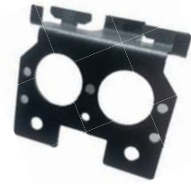
Mount for Front Panel M62