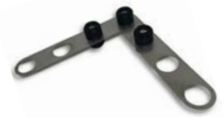
Connector Double 90° extra D30 Holes