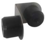
Angled Connector 90° (2 pins)