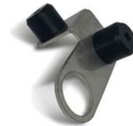
Angled Connector 90° 3mm (2 pins + D30)