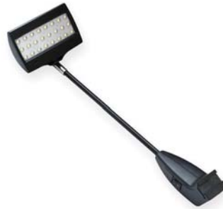
CeLed 20W and CeLed 20W Linkable