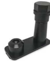
CeLed Connector Lockable