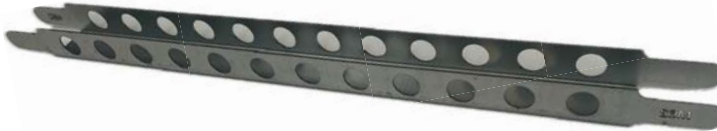
Ceiling Support M62