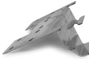
Mount for Reinforcement M62