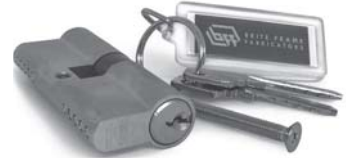
Cylinder Lock w/ 2 keys Spare 2-key set (additional, NHD012)