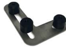
Connector Flat Slidable 90° (3-Pin, Left & Right)