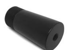
Half Screw Connector M8