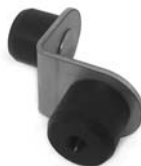
Angled Connector 90° 3mm (2 pins)