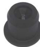
Pin M8 with Collar