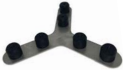
Connector Flat Y