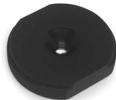
Inner Nut D30 M5