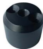
Pin M8 + 2D4,5