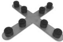
Connector Flat X