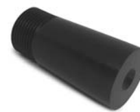
Half Screw Connector M6