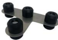
Connector Double T